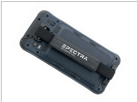
MobileMapper 60 handheld with MobileMapper field software